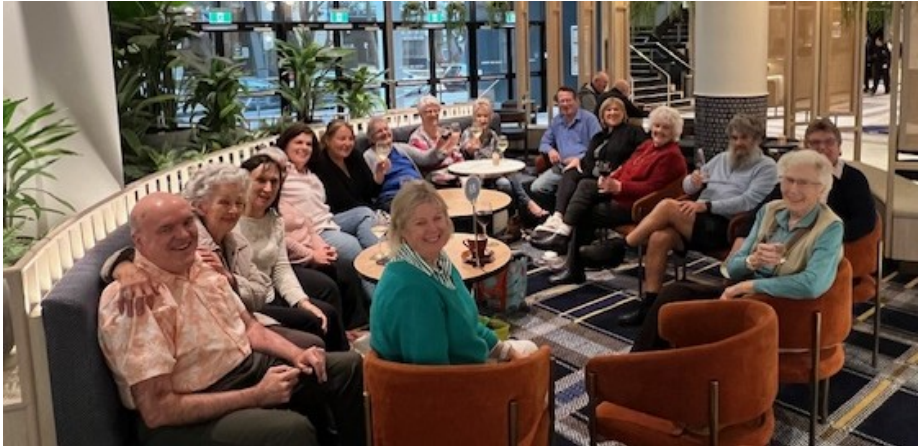
Relaxing after Charity Day on Thursday May 16