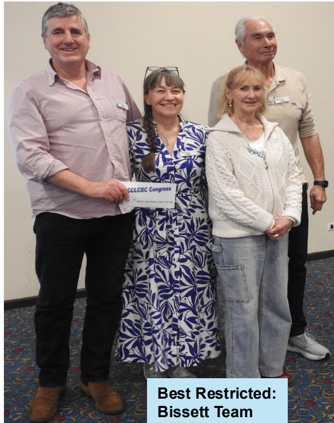
Best Restricted: Bissett Team