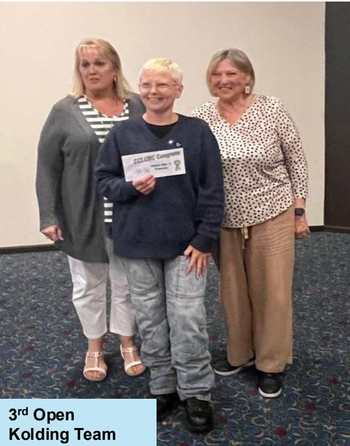
3 rd Open Kolding Team