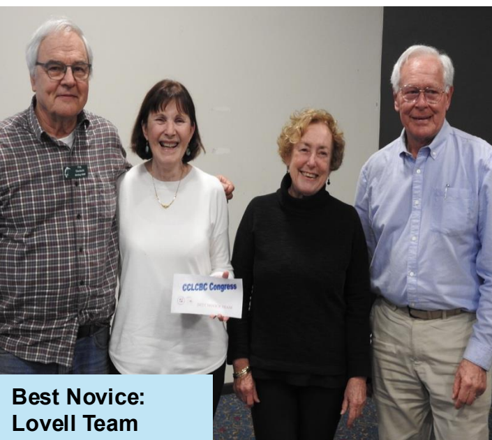
Best Novice: Lovell Team