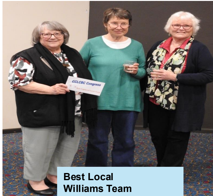
Best Local Williams Team