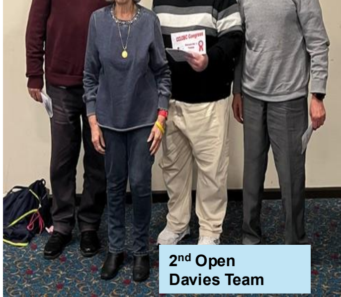
2 nd Open Davies Team