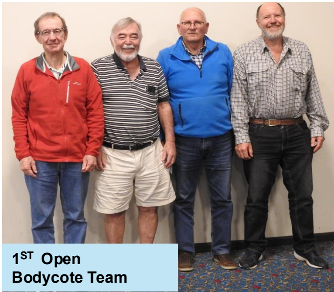
1 st Open Bodycote Team