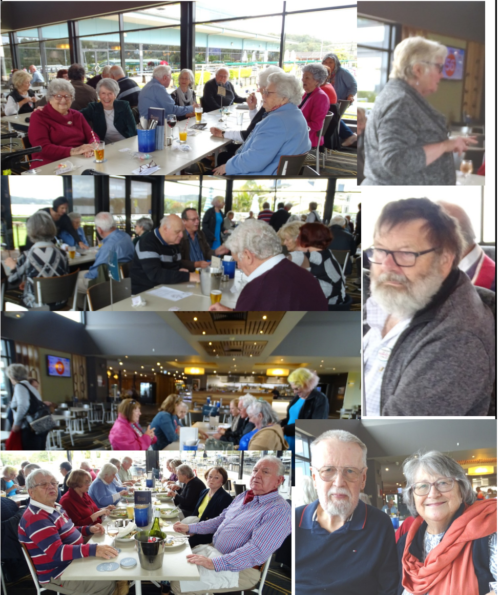
Above Left: Before the lunch and Digging in . . (and Page 8)

L to R: The Sorrento at Woy Woy wharf, Inside, Outside, a foursome (?), Disembarking, Starting the walk.